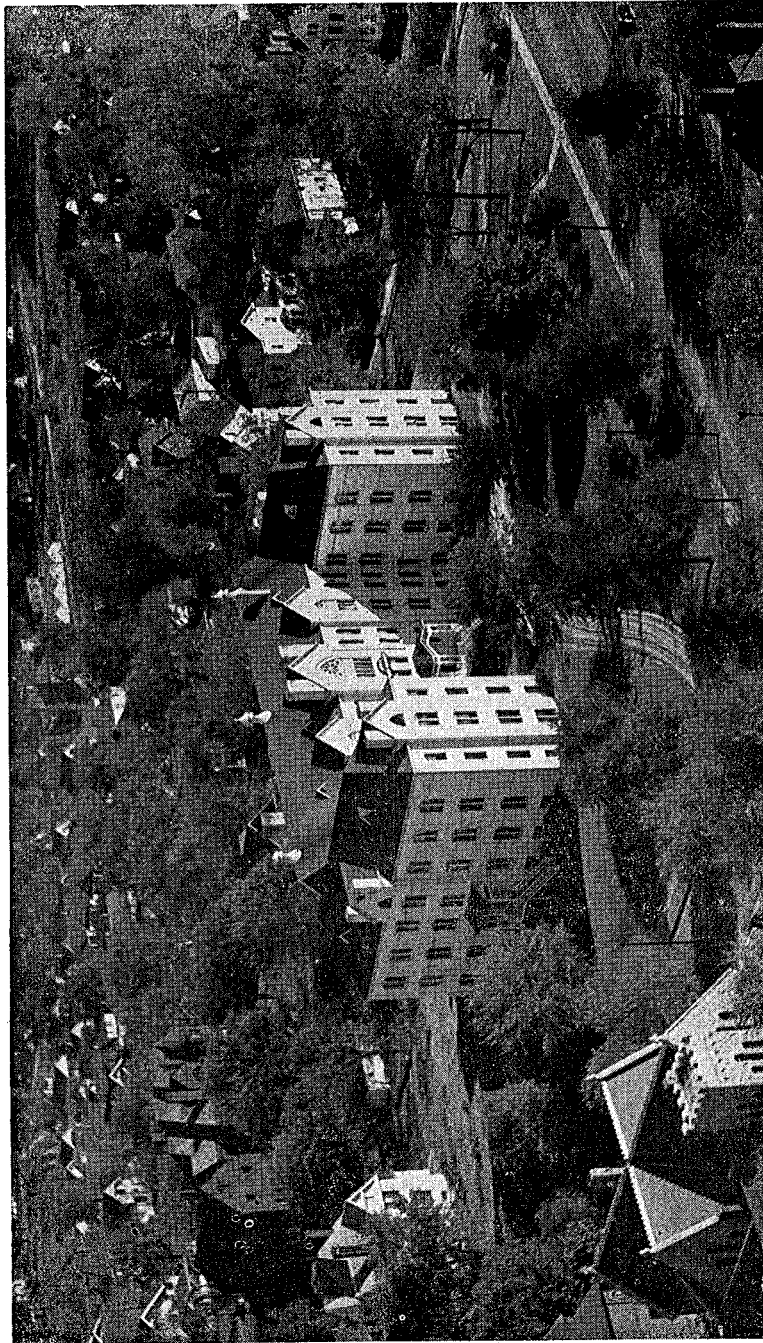
An Air View of Grace Bible Institute